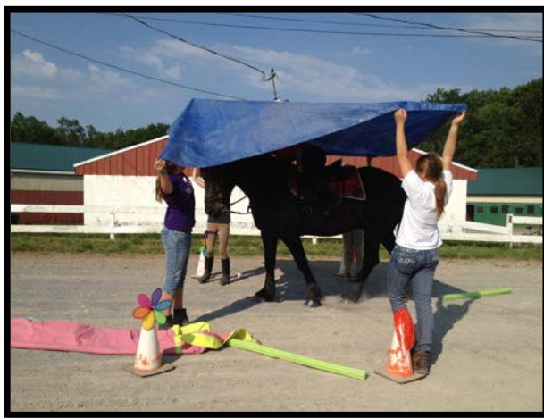
Shamrock demonstrating under the Parachute Tarp

The variety, challenge, and skill of achieving an obstacle can help build that horse and rider bond which so many of us are looking to attain. However, it's important we teach our horse to trust us and not just push him through. How do we do that? If you were kicked into doing something, it's unlikely you'd have a willing attitude. The same goes for our horse. We need to take the time to build his confidence and encourage him with a proven process that develops trust. The slower we go, the faster we'll get there.