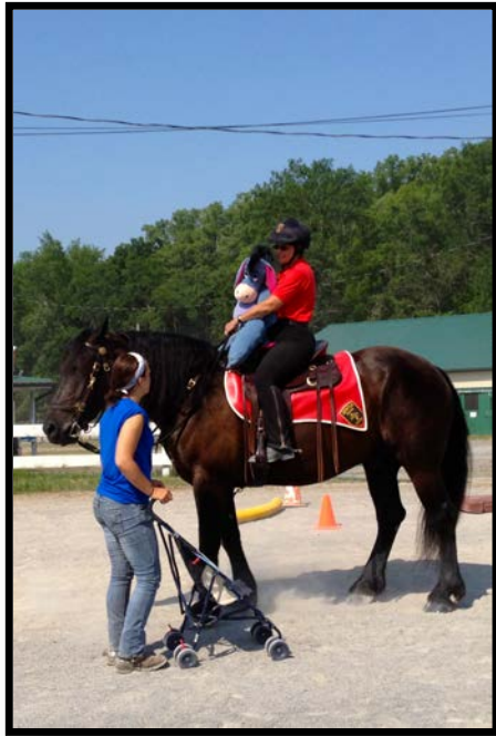
Shamrock and baby stroller training

Having a patient volunteer driver to help you work through the exercise is crucial. The car only moves upon rider command and the driver starts out slowly for only a few feet. The process is lengthy and patience is crucial to develop the building blocks of trust. As each step is successfully executed, additional complexity can be added until you reach the point of walking beside the moving car.