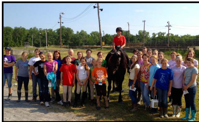
Shamrock loved the 4H group!

Just yesterday we were talking to one of the 4Hers that had watched the demonstration and he delightfully shared that he went home and used some of the techniques and enthusiastically said, "They really WORKED!" The feedback is always so gratifying and